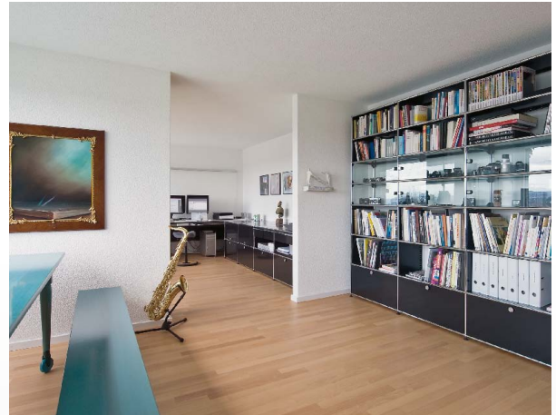
Design studio “Kraft Visual”, Fällanden (Switzerland)

Mira Brand, Colour Designer, plus art shop and paint supplier