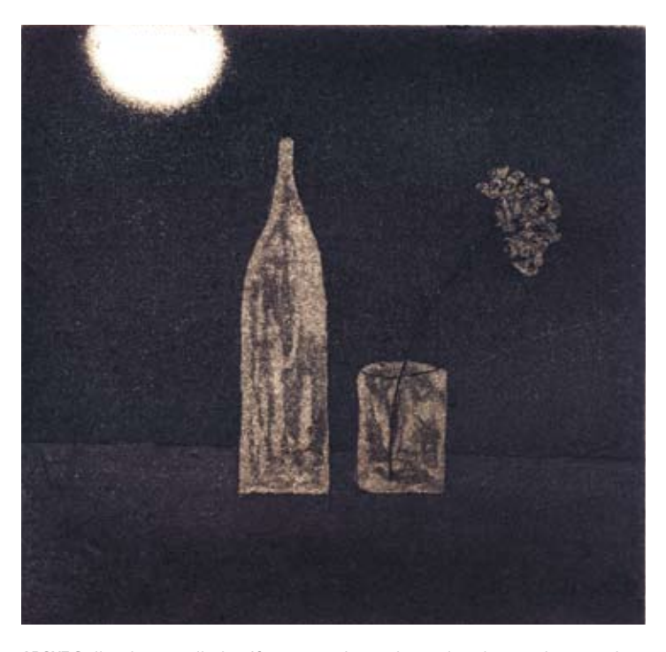
ABOVE Seiler then applied uniform aquatint to the entire plate and stopped out some areas. The plate was stage-bitten, interesting lines with ragged edges. If there are clearly visible stripped and proofed, transforming the image from linear to tonal.