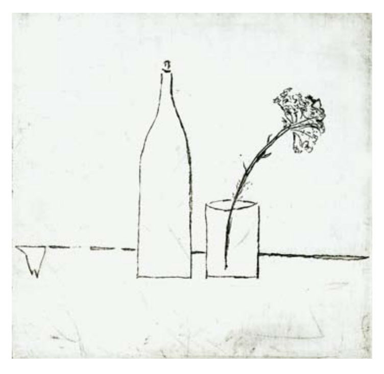
ABOVE Gabriela Seiler (Switzerland), 2005. The artist drew into Lascaux Hard Resist, etched, then stripped and proofed the plate to create this linear image.

Light areas can be created by stopping-out shallowly bitten sections during the etching process. Dense velvety tonal effects may be achieved by repeating the entire aquatint process several times with increasingly small particles. An aquatint test strip should be made and printed for each type of aquatint and mordant to determine how the different depths of bite will hold ink and print.